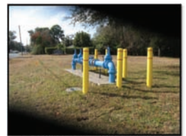
Perrine Ranch Road (@ FGUA Offices)

Lindrick Maintenance and Improvements: Three lift stations, including a lift station near Sea Forest Drive and Egrets Place , a lift station behind the Southgate Shopping Center on U.S. Highway 19 , and a lift station near Shellstream Boulevard and Floramar Terrace are being rehabilitated. We will soon remove the existing wastewater treatment plant, located near the Landings of St. Augustine Condominium Community. These rehabilitated lift stations will draw wastewater to a nearby City of New Port Richey wastewater treatment plant.